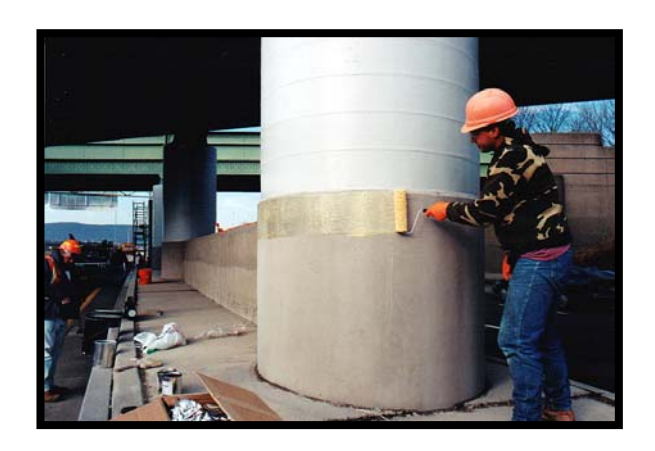
Roller Application of Adhesive

The adhesive was applied and allowed to "tack-off" before the application of the 22-77 Structural Prepreg Cloth. By applying the 22-77 Structural Prepreg Cloth to the adhesive when it has "tacked-off" adhesion to the concrete sub-straight is assured.