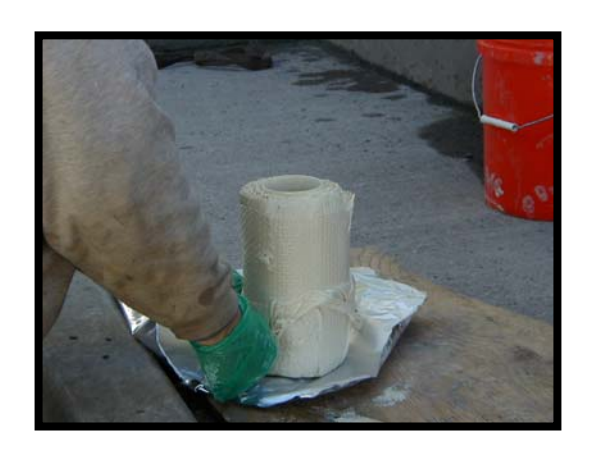
Unpacking Aquawrap 22-77

Aquawrap 22-77 Concrete Repair System consisted of three components: 22-77 Structural Adhesive, 22-77 Structural Prepreg Cloth, and 22-77 Veil Prepreg Cloth. 22-77 Structural Adhesive is a two part bonding material designed to produce a bond between the 22-77 Structural Prepreg Cloth and the concrete substrate. 22-77 Structural Prepreg Cloth is the main structural component of the repair system. This is a woven roving material impregnated with the water cured resin system. The material comes packaged in moisture-tight packaging.