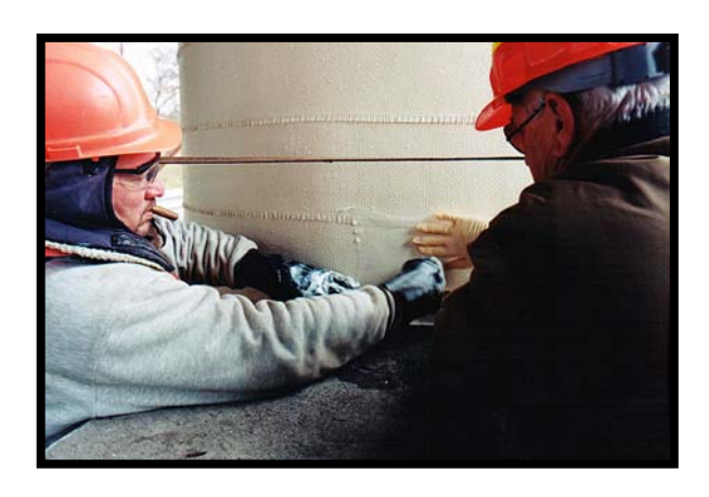
Start of Veil Layer