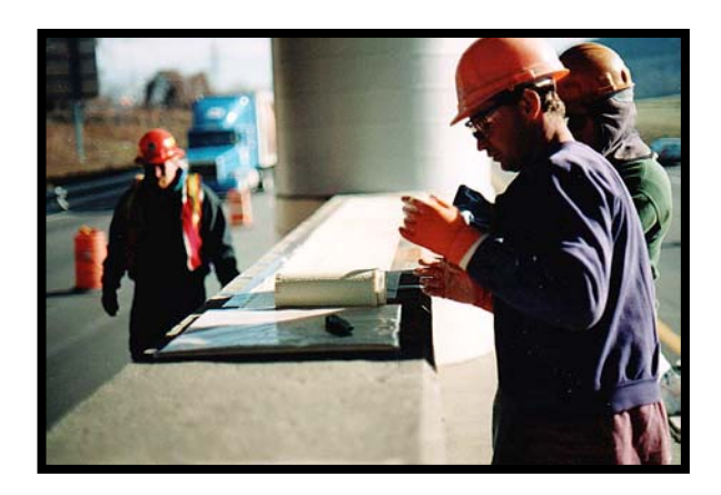
Laying-up Durability Samples

In order to ascertain the long-term durability of the Aquawrap 22-77 system, durability samples were made on the structure. Enough material was put down on the structure to pull a sample each year and do mechanical tests.