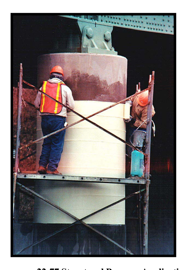
Aquawrap 22-77 Structural Prepreg Application

Aquawrap 22-77 Structural Prepreg Cloth is applied by wrapping it around the column and onto itself for the second layer. This process is repeated for the entire length of the column. Since the system is a water-cured system, water is sprayed on each layer as the material is applied. This is a confinement application therefore does not require the use of Aquawrap 22-77 Structural Adhesive.