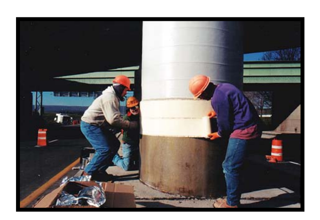
Structural Layer over Adhesive

The 22-77 Structural Prepreg Cloth is applied to the bull-nose in the same manner as applied to the columns. The first layer of 22-77 Structural Prepreg Cloth is allowed to "tack-off" before the application of the second layer. This again, allows for better bonding.