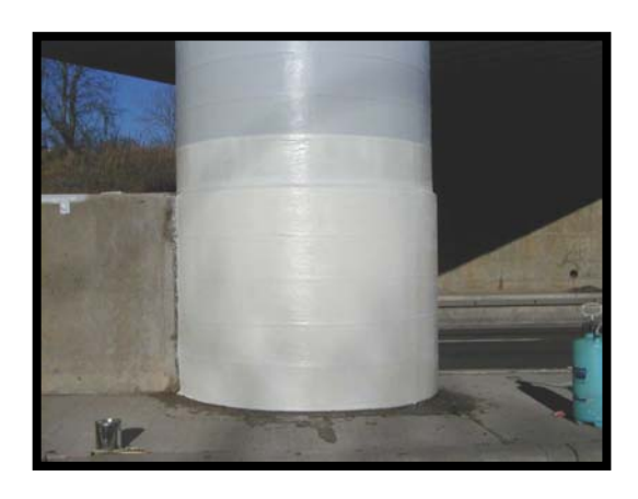
Completed Veil Over Bull-Nose

The NAVLIGHT ER 22-77 Veil Prepreg Cloth is applied over the structural material. The NAVLIGHT ER 22-77 Veil Prepreg Cloth is not wrapped in this case. It is applied in the same manner as the structural material.